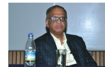
N.R. Narayana Murthy Executive Chairman Infosys Limited