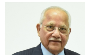
Dr. Prathap C. Reddy Founder Chairman, Apollo Hospitals