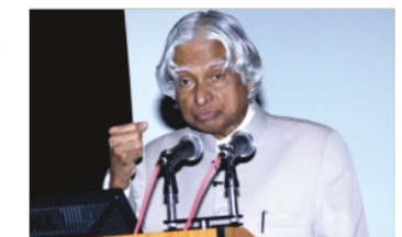
Dr. APJ Abdul Kalam Former President of India