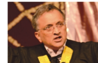
Ramachandra Guha Distinguished Author