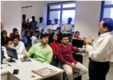
Mock Stock Room

While studies are of paramount importance on the campus, the adage 'all work and no play makes Jack a dull boy' prompted us to provide facilities, other than for studies, while planning the campus. Our infrastructure facilities go a long way in developing the overall growth of our future corporate honchos. The facilities provided are: