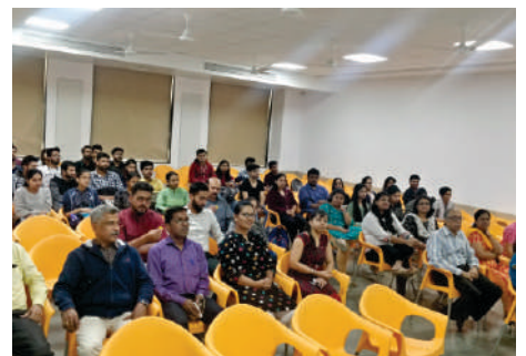
Well-equipped Seminar Room