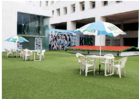
The KMS Lawn