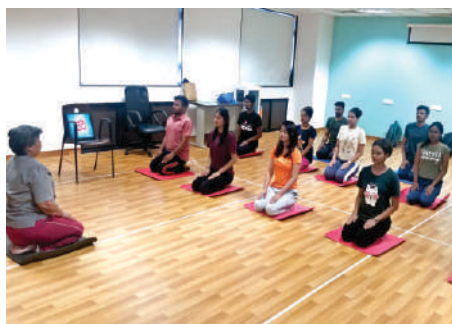
Yoga Room & Cultural Centre