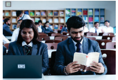
Learning Resource Center