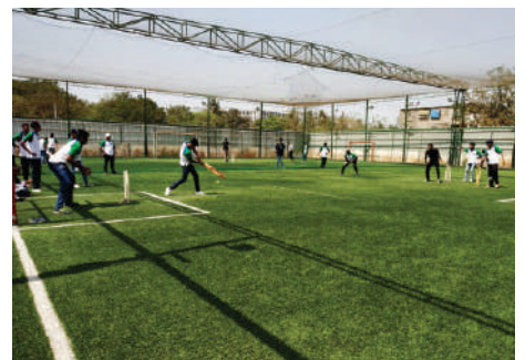
KET Turf Park